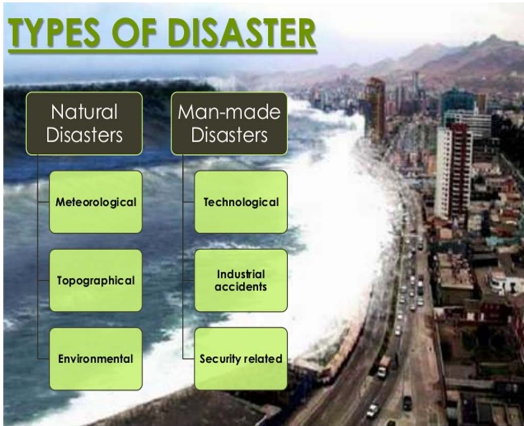
Figure 1: Type of Disaster